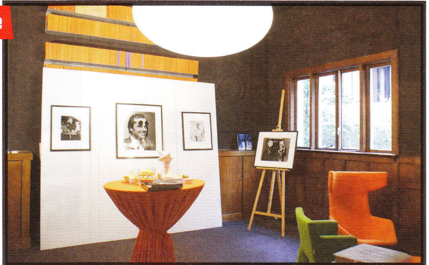
Some of paparazzo Ron Galella's work on display at GMW Advocaten recently.

The firm is looking at more events of this ilk in the future following the success of this exhibition. It is also considering hosting information sessions for internationals. See www.gmw.nl/en for more details.